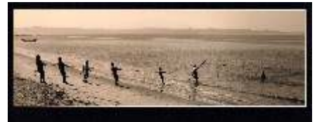
Vilas Parab 3rd in BW