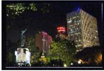
Ganesh Ambokar 3rd