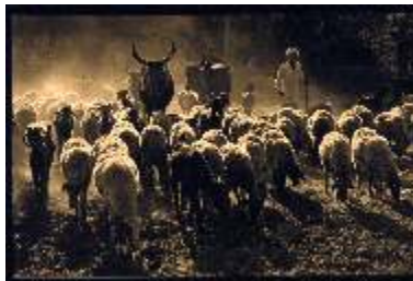
Vaibhav Jaguste 2nd in BW