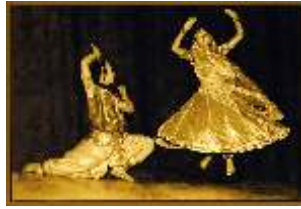
Abhay Salagre Acpt