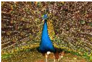
Arjun Kamble Acpt