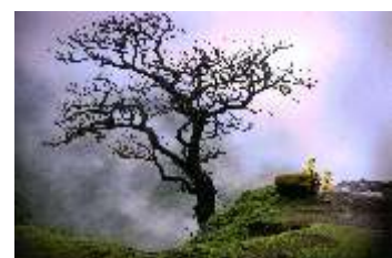
Deepak Bartakke Acpt