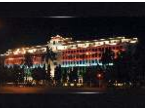
Nagesh Sakpal APSI Acpt