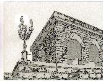
Dattaraya Padekar Acpt