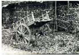
Arjun Kamble Acpt