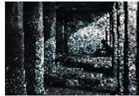
Rakesh Soni Acpt