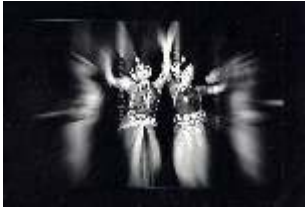
Rakesh Soni 2nd in BW