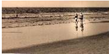
Vilas Parab Acpt