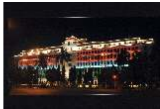
Nagesh Sakpal APSI Acpt