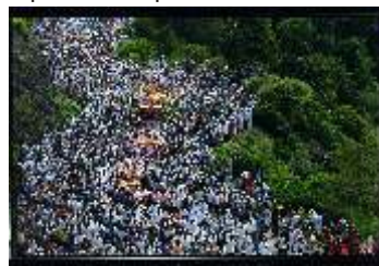
Vaibhav Jaguste Acpt