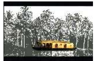
Utsav Jhingan Acpt

THE PHOTOGRAPHIC SOCIETY OF INDIA an oldest Institute