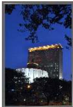
Nagesh Sakpal APSI Acpt