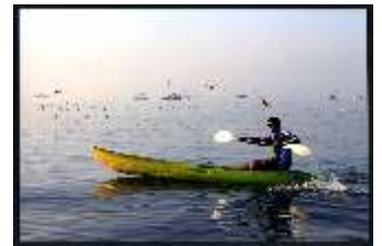
Abhay Salagre Acpt