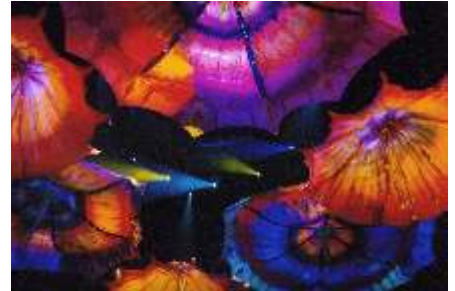
Amishi Savla Acpt