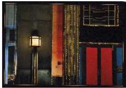
Ganesh Ambokar Acpt