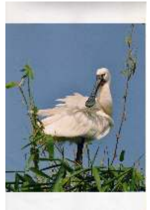
Xersis Tampil Acpt