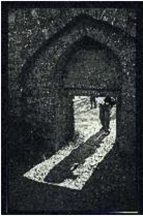
Vaibhav Jaguste Acpt