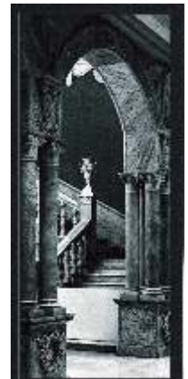
Ganesh Ambokar 3rd B / W