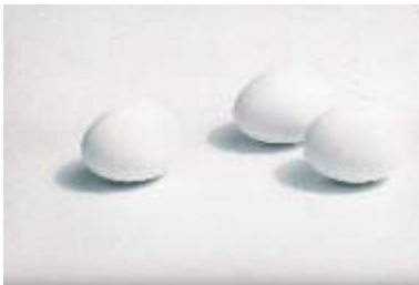
Vilas Parab Acpt