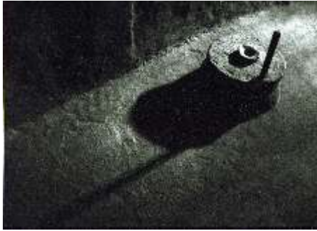
Aditya Waikul 2nd in B / W