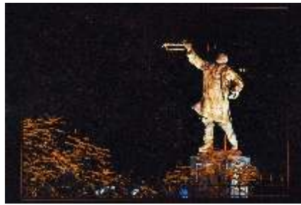
Ganesh Ambokar Acpt