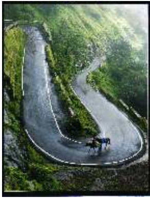
Santosh Sawant Acpt