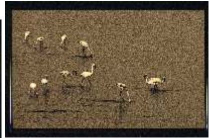
Vaibhav Jaguste Acpt