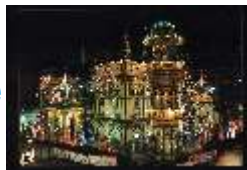
Sanket Rathod Acpt in Col