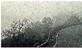
Milind Vedpathak Acpt in B/W