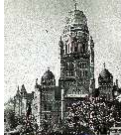
Rakesh Soni Acpt in B/W