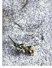
Vaibhav Jaguste Acpt