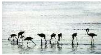
Rakesh Soni Acpt in B/W