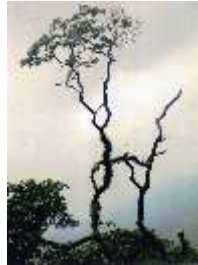
Yash Sancheti Acpt in Col