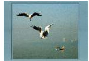
Ganesh Ambekar Acpt