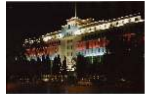
Ravi Sapkal Acpt in Col