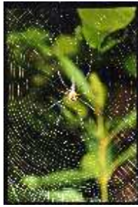
Sanket Rathod Acpt