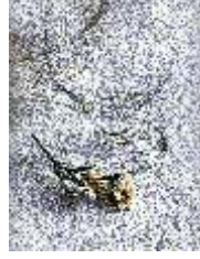
Vaibhav Jaguste Acpt