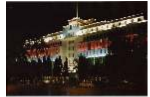
Ravi Sapkal Acpt in Col