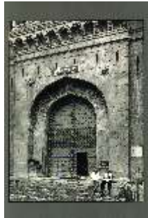
Sanket Rathod 3rd in B/W