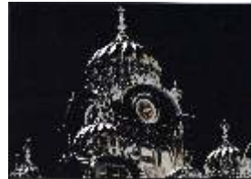
Milind Vedpathak Acpt in B/W