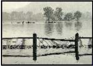
Milind Vedpathak 2nd in B/W