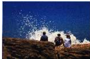
Datta Sawant Acpt