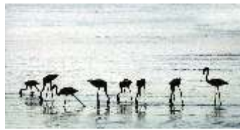
Rakesh Soni Acpt in B/W