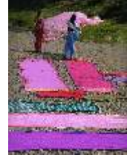
Vaibhav Jaguste Acpt