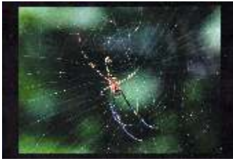
Sanket Rathod 2nd