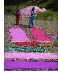
Vaibhav Jaguste Acpt