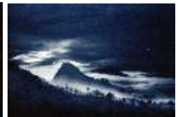
Rakesh Soni Acpt in Col