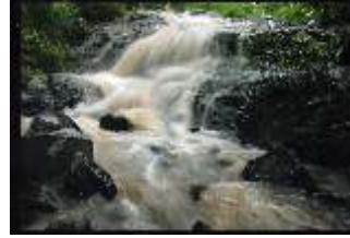
Sanket Rathod Acpt