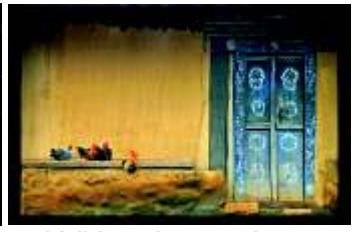
Vaibhav Jaguste Acpt