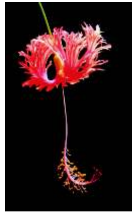
Sanket Harchekar Acpt