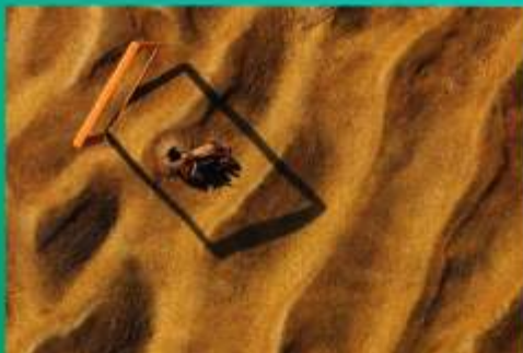
Sanket Harchekar (Members)