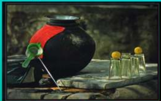
Vaibhav Jaguste (Outing)