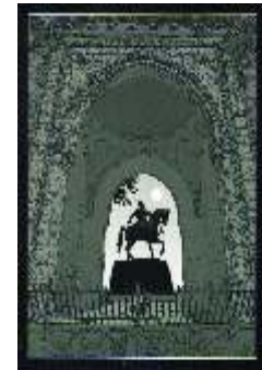
Dattatraya Padekar 2nd in B/W