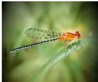
Rakesh Soni 2nd Col