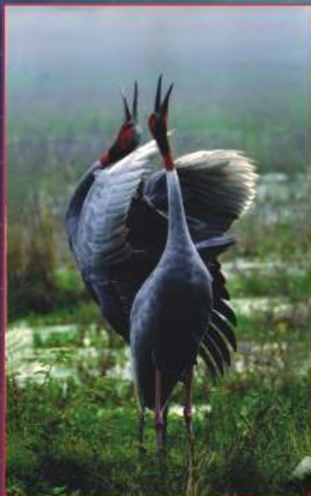
Ganesh Ambekar photograph of the year Members

THE PHOTOGRAPHIC SOCIETY OF INDIA RS. 10/- SEPTEMBER 2011