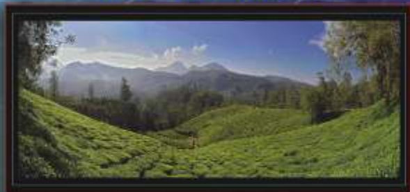
Certificate of Merit Sunil Marathe