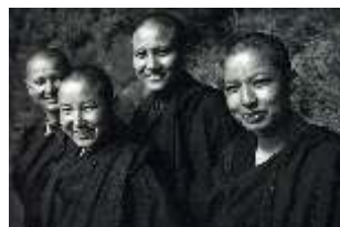
Nemji Chedda Acpt