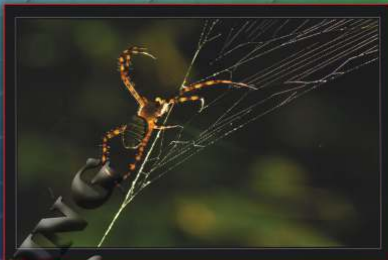
Vaibhav Jaguste photograph of the year outing