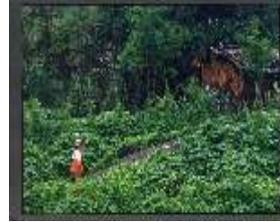
Pramod Satose Acpt