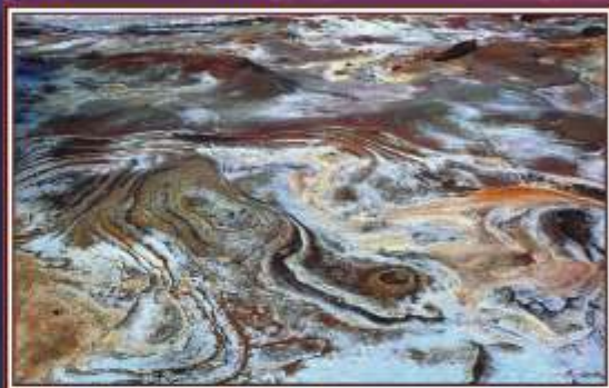
Certificate of Merit Prakash Dhalwal