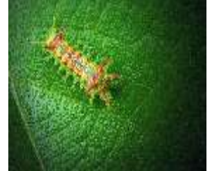
Sanket Harchekar Acpt