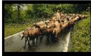
Sanket Rathod Acpt