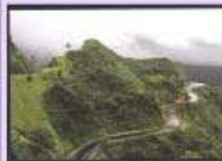
R B Pednekar