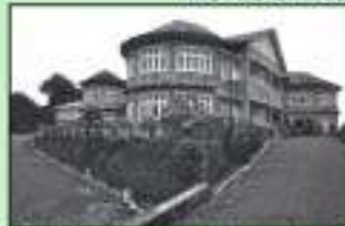
Yashodhan Navghare 2nd