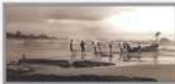
Deepak Bartakke 2nd