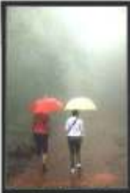
Sanket Rathod 3rd