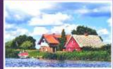
Beenu Rajpoot 3rd