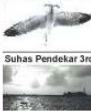
Suhas Pendekar 3rd