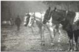
Milind Vedpatak 2nd