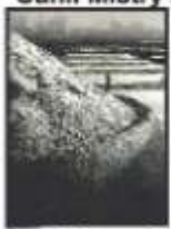
Suresh Bangera 3rd