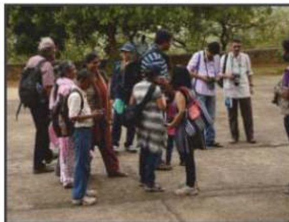
Some of the members in Outing to Kanerhi Caves.