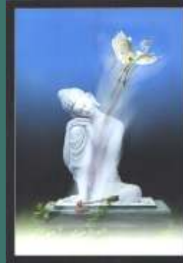
Suresh Bangera 2nd