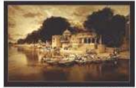
Suresh Bangera 3rd