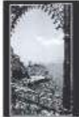
Maheesh Ambare 2nd