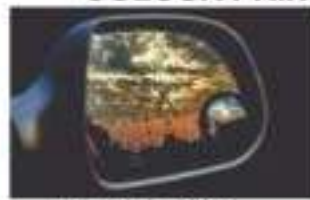
Hitesh Soni 3rd