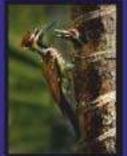
Suresh Bangera 3rd